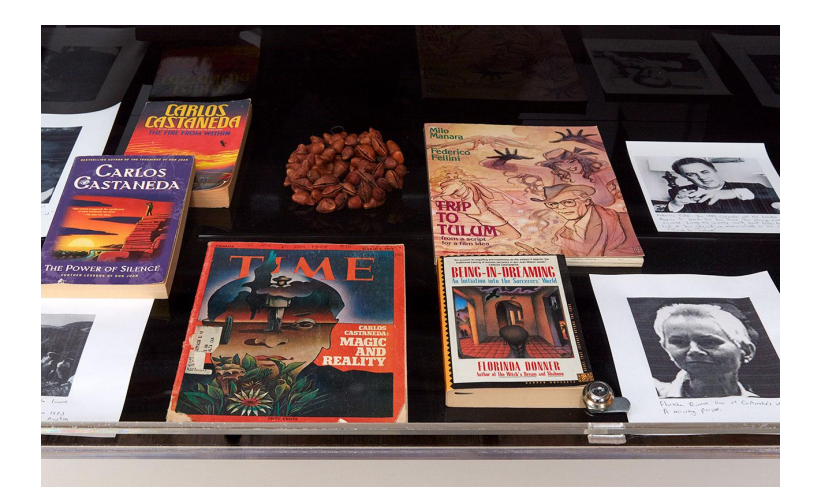
robert(a) marshall, 'Bardo Road', 2021, exhibition view, Participant Inc, New York. Courtesy: the artist and Participant Inc, New York

Several short, looped videos play on flatscreens hung amongst the photographs. Notions of reflectivity continue here, too: the artist uses a feature of Zoom to superimpose footage of themselves, moving slowly in front of the camera, onto background images. Several of the photographs that appear as backdrops were pulled from the artist's family albums – images of marshall as a child ( Double Self Portrait , 2021) or their father ( I Enter My Father's Chest , 2021).